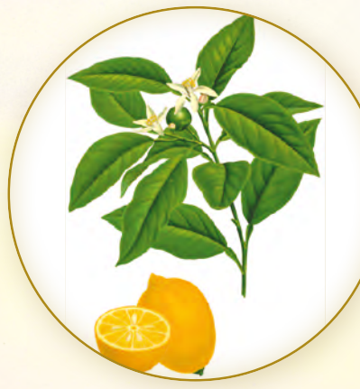
Lemon (Citrus limonum (per))