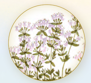
Thyme, thymol (Thymus vulgaris Ct. thymol)