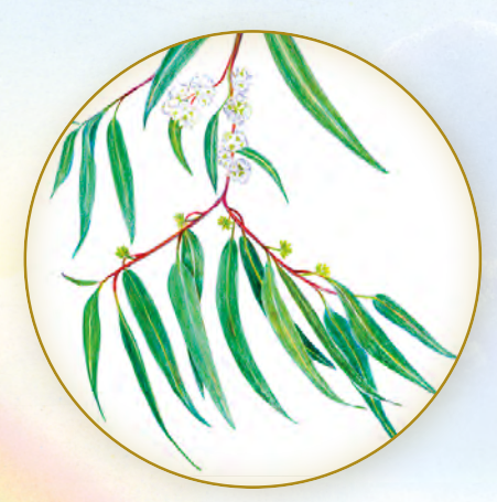
Eucalyptus, radiata (Eucalyptus radiata)