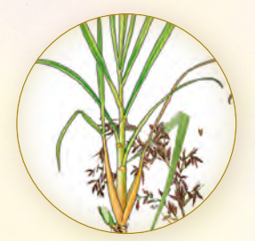
Citronella (Cymbopogon winterianus)