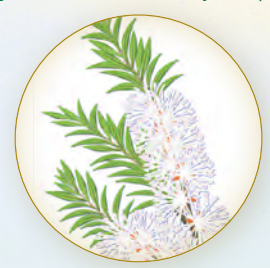
Tea Tree (Melaleuca alternifolia)