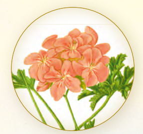
Geranium Rose (Pelargonium asperum)