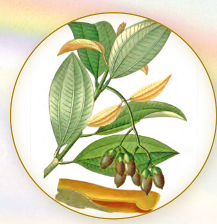
Cinnamon bark (Cinnamomum verum)