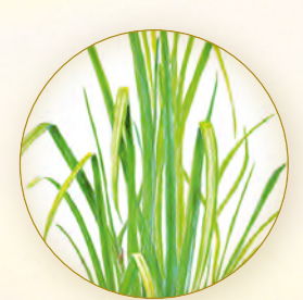
Lemongrass (Cymbopogon flexuosus)