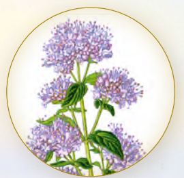
Oregano (Origanum compactum)