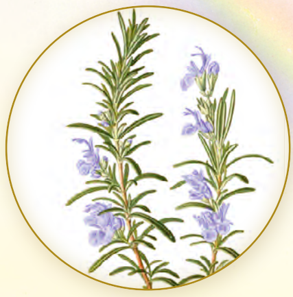
Rosemary, cineol (Rosmarinus officinalis Ct. cineole)

Essential oils have been used for thousands of years with the aim of improving health and well-being. Certain essential oils have antimicrobial, antiviral, anti fungal, insecticidal, and antioxidant properties in various potencies. It is important that essential oils be used in the prescribed way by following the 'how to use' advise connected with the product.