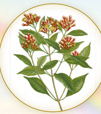
Clove bud (Eugenia caryophyllus)