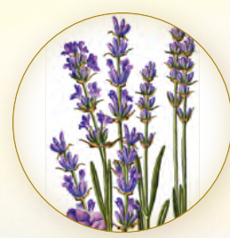
Lavender (Lavandula angustifolia)